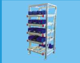
FIFO Storage Rack