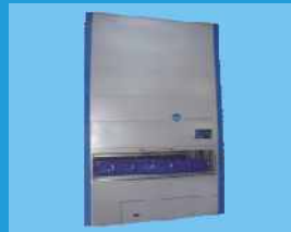
Auto Store Lift